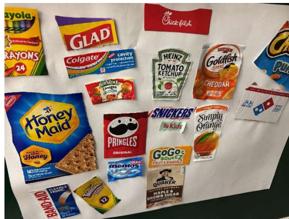
Examples of environmental print

M: chicken sandwich, tater tots, fruit and milk