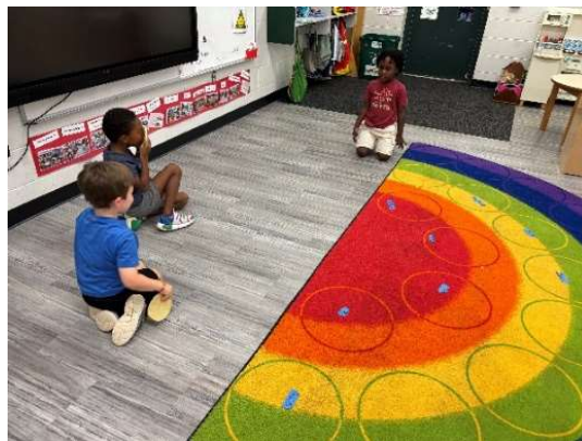
Rolling pancakes and tortillas